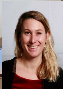
ASH® Annual Meeting